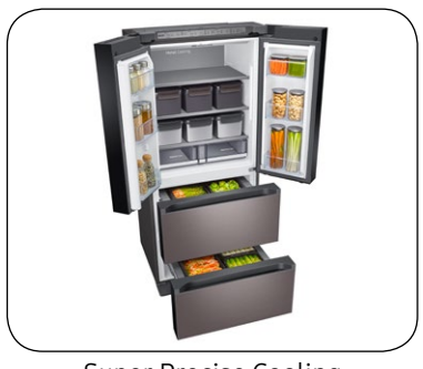
Super Precise Cooling